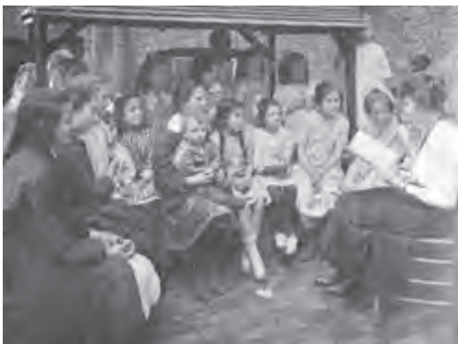
A Progressive Era settlement house.

Maria Montessori described children as the most oppressed group on earth. We think of her as having an interesting spin on hands-on learning, but she had an incredible, trenchant critique of how we treat children and thwart their innate capacities to achieve independence and contribute to society from this healthy place of accomplishment.